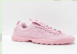
The pink shoe