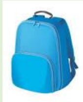
The blue bag