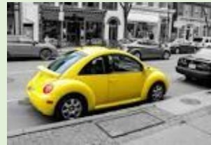
The yellow car

EVALUATION: The pupils are evaluated thus: