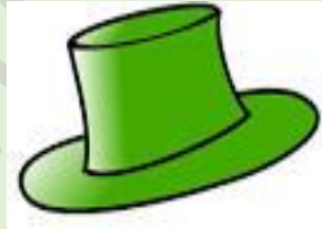
The green hat